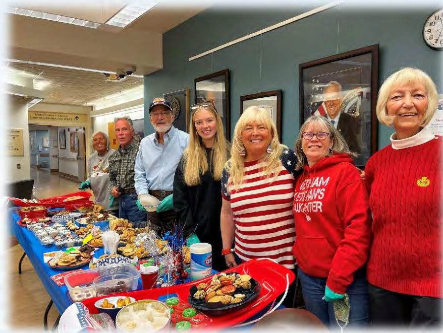
On December 13th the Ouray Lodge set up a free dessert bar at the Grand Junction VA. The Telluride Lodge brought gifts for the residents of the VA Community Living Center.